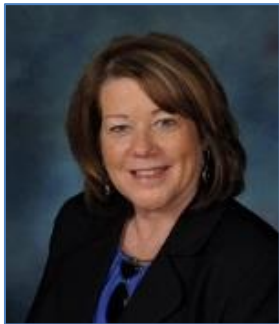
Head of School Lowell High School